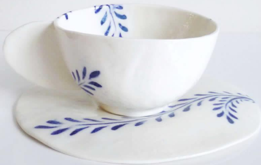
Leaf Coffee cup

Poetic and vintage spirit for those cup and saucer- flat or slightly raised.