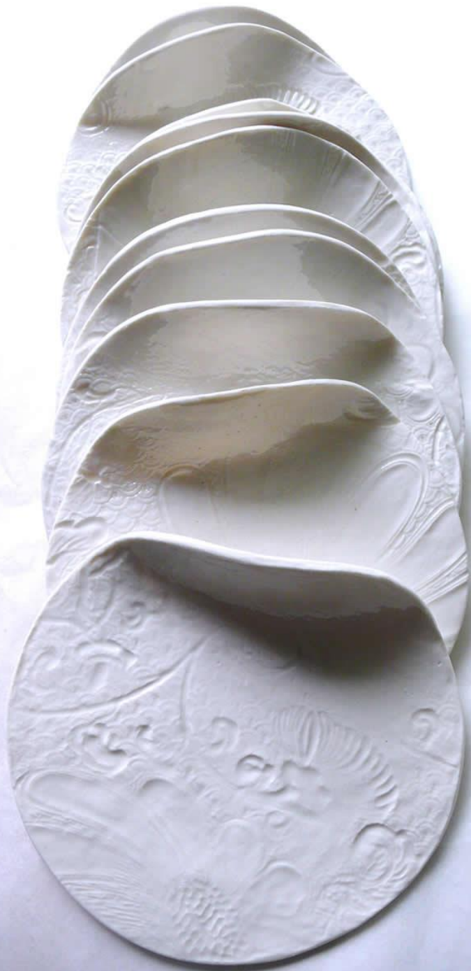
Van Gogh Side up plate

With a raised side. Plain white or with a pattern.