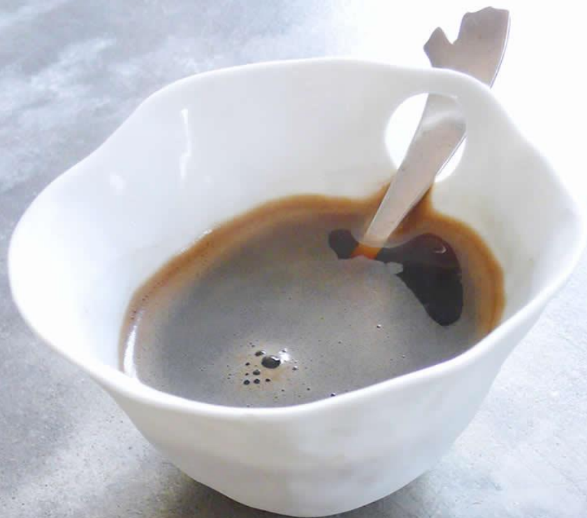
Moho Coffee /tea cup

Sensual with two textures: enamelled inside, raw outside Nice detail of a hole to take easily the item and play with your imagination.