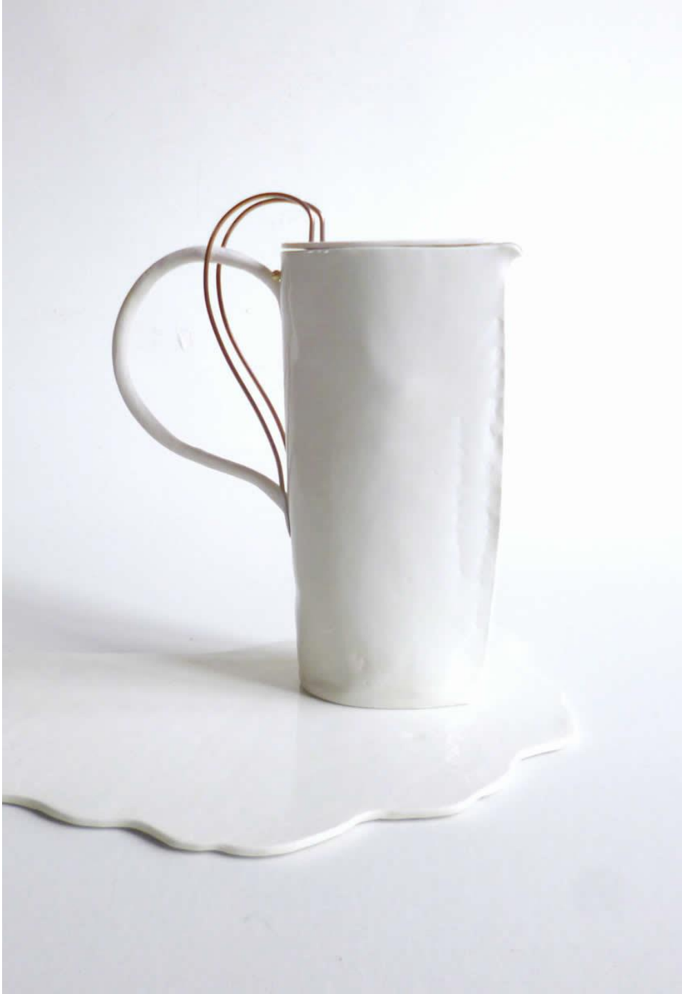
Rythm Coffe jug

Amazing sculptural piece. With a game of arabesque lines of porcelain and brass for the handle.