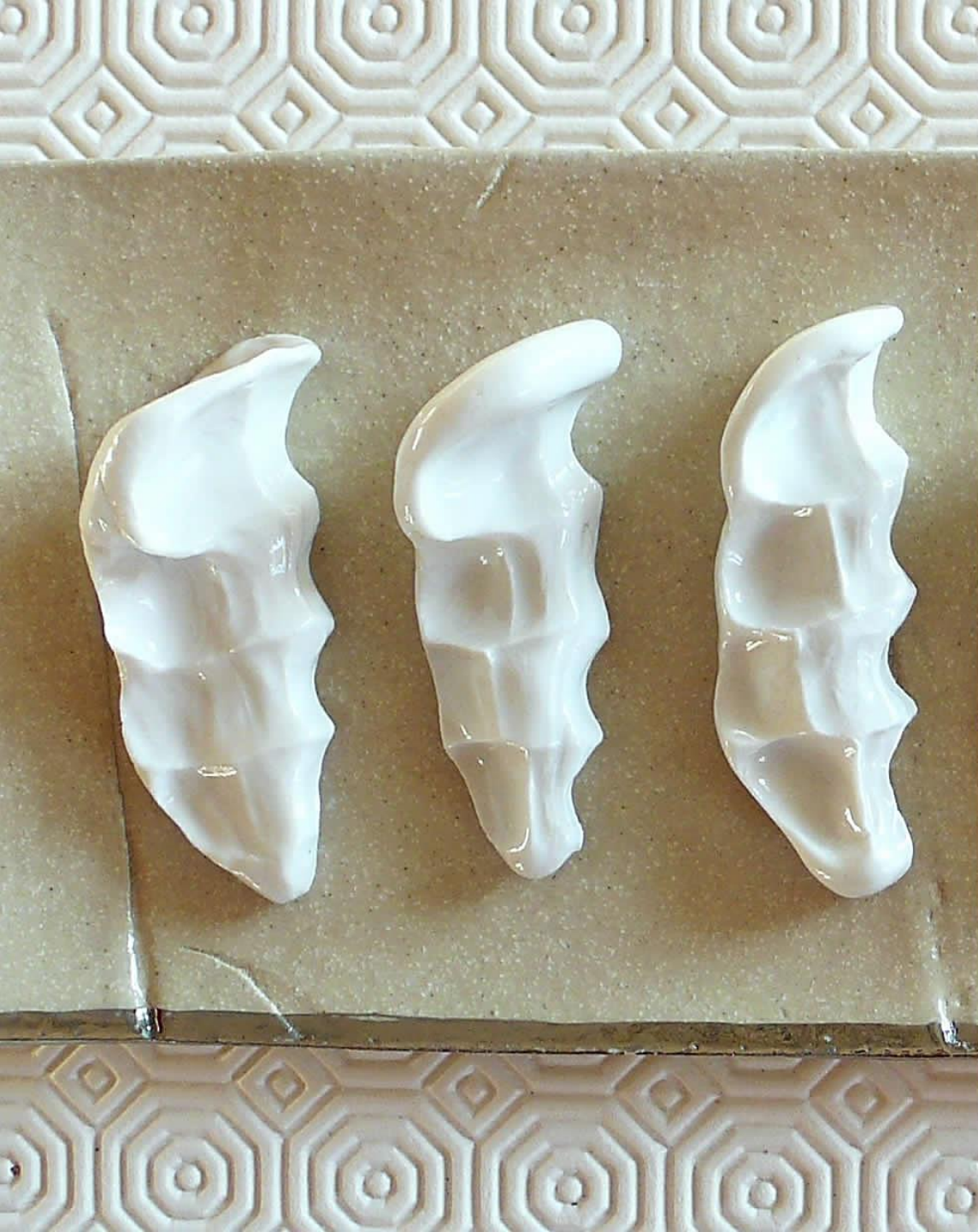
Bones Knife holder

Fingers print of Isabelle Poupinel's hand.