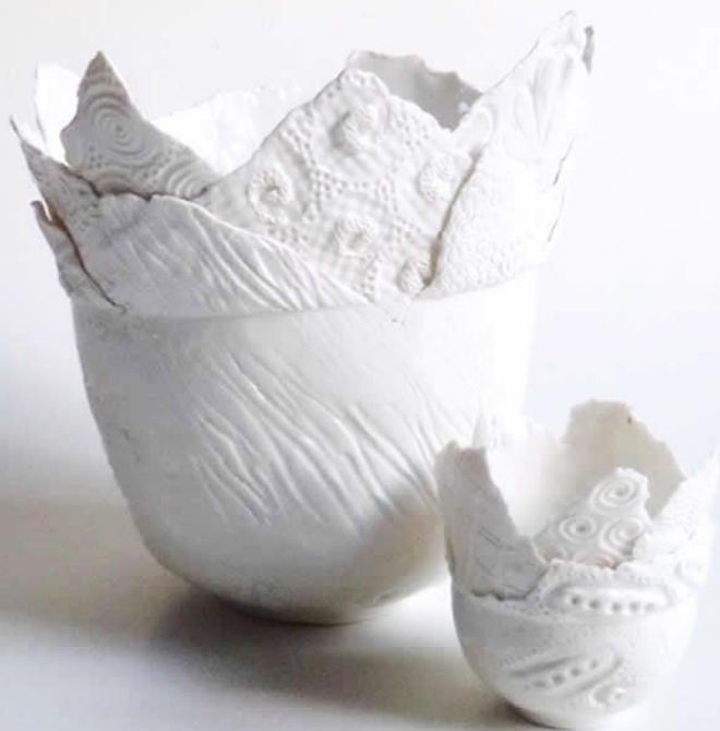
Jurassic Candle jar, vase