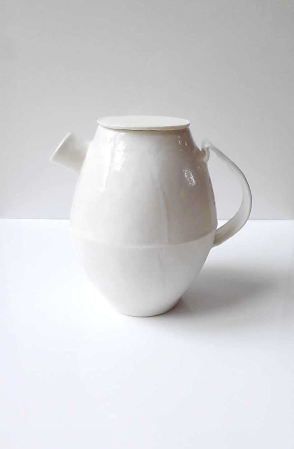
Maggie Tea or coffee jug

Modern shape with an arabesque handle and a flat cap.