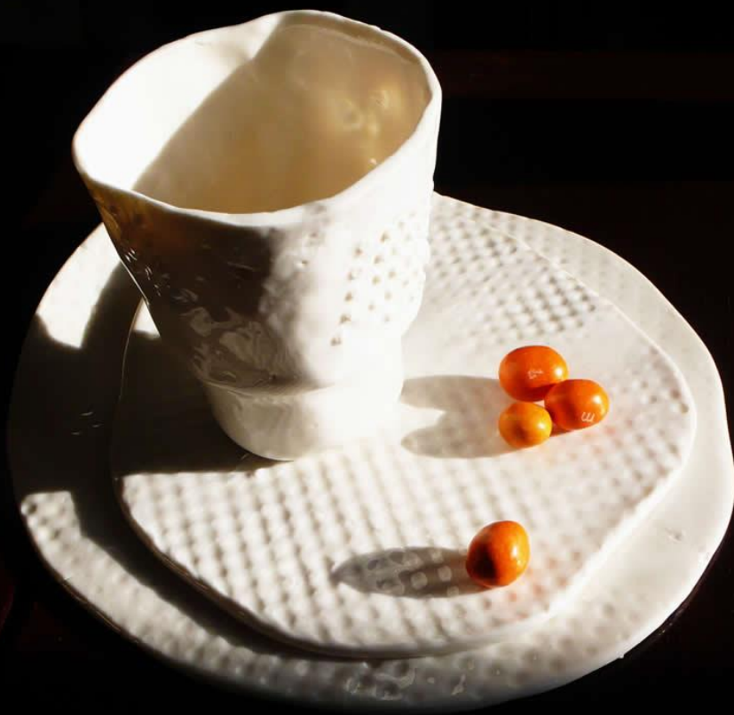
Poiana Coffee and tea cup

Cup without handle as a mazagran. Pattern of relief dots contrasting with the pattern of the saucer-plate